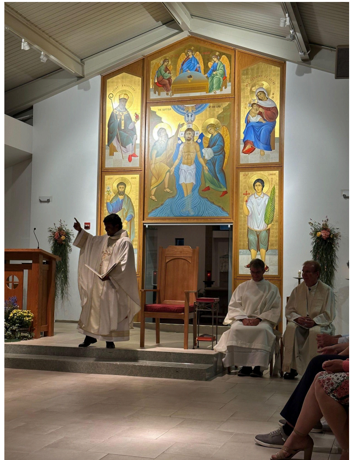
Icons on Display During the Easter Vigil