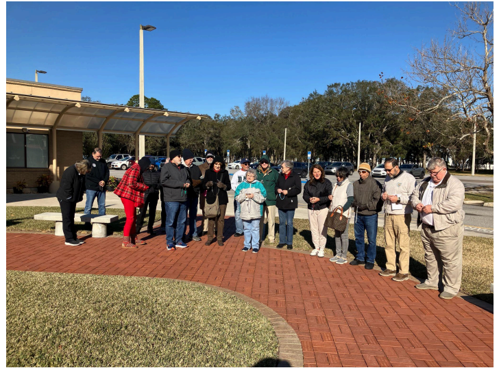
March for Life Event