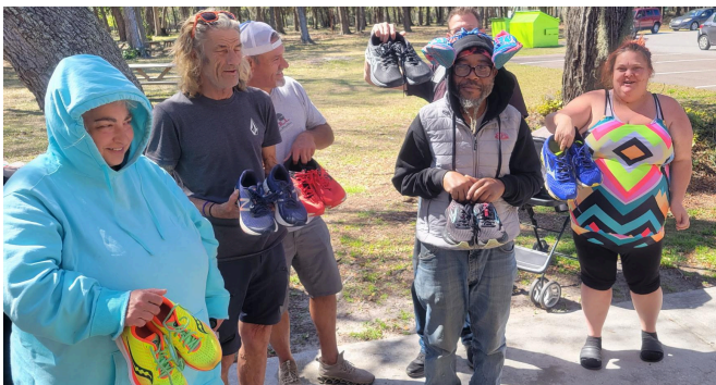
Shoes Obtained at Special Olympics Gate River Run Given to Homeless