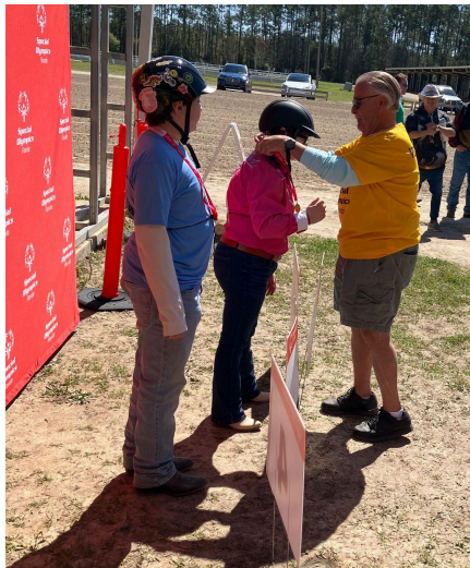
Special Olympics Equestrian Event Awards Ceremony