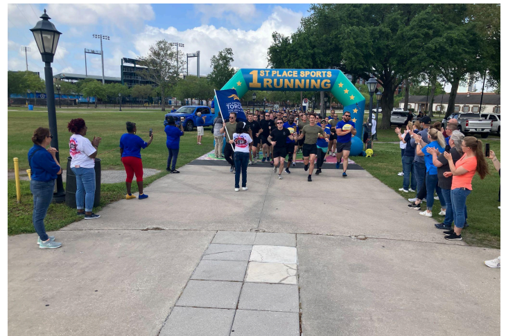
Special Olympics Race for Inclusion