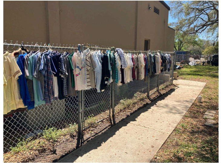
Food for Families Clothes Giveaways